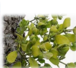
Mistletoe Phoradendron leucarpum