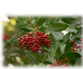
Toyon Heteromeles arbutifolia