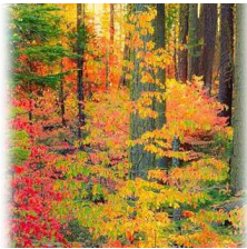
Pacific dogwood Cornus nuttallii