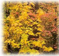
Mountain maple Acer spicatum