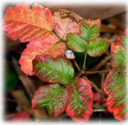
Poison Oak Toxicodendron diversilobum