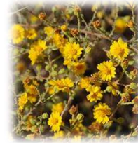
Tarweed Holocarpa heermannii