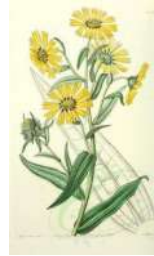
Madia Madia elegans