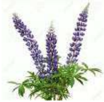
Lupine Lupinus polyphyllus