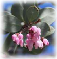
Manzanita Arctostaphylos patula