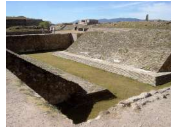
Above: Ball court in Monte Alban. Below: Hoop through which a very heavy ball was to be thrown