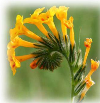
Fiddleneck Amsinckia menziesii