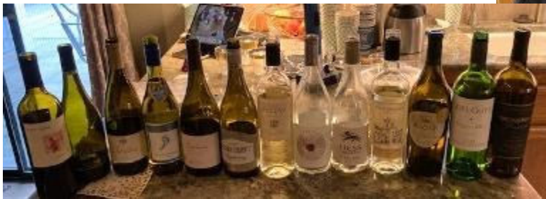
Both red and white varietals; lots to taste, lots to enjoy!