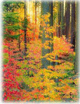
Pacific dogwood Cornus nuttallii