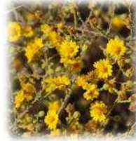
Tarweed Holocarpa heermannii