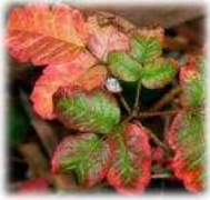
Poison Oak Toxicodendron diversilobum