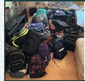
Filled and ready to distribute