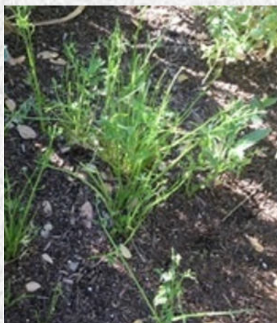
Carrots with no tops

mice and wood rats were all caught red handed in the garden. Oh, and an opossum.