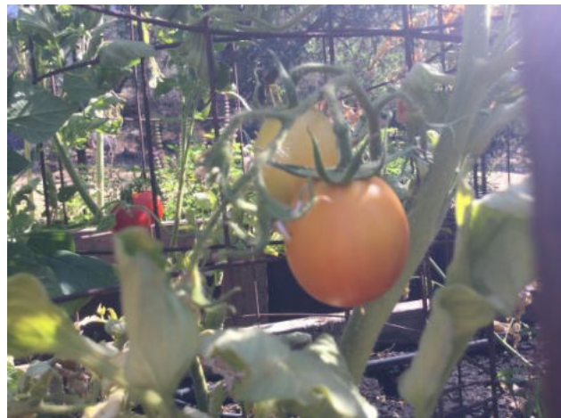
Aren't Early Girl tomatoes supposed to be larger than 1.5 inches and a little riper by now?