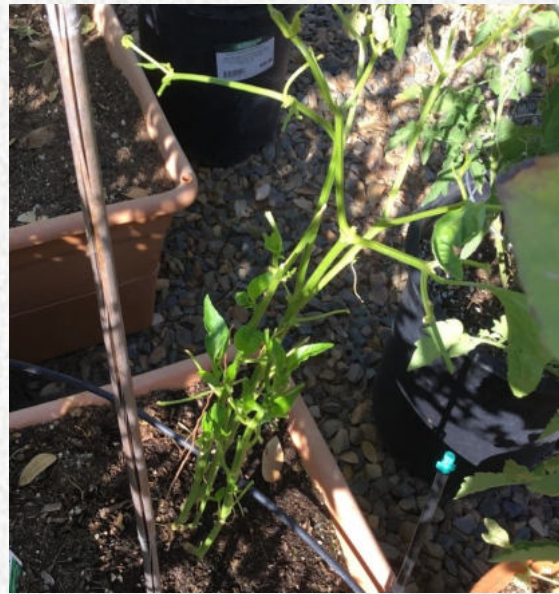
Pepper with no leaves

Remember, you don't have to be an accomplished gardener to join the AAUW Garden Group. I am a shining example of not being accomplished! Hope we will be able to do something together this year!!!!