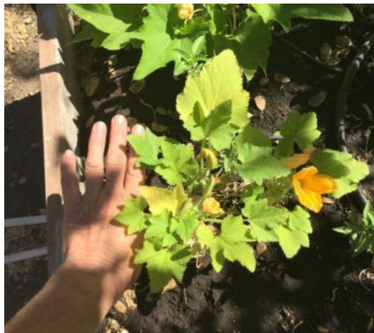
Jill's sorry excuse for a squash